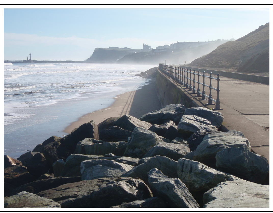
Whitby Sands, Promenade and West Cliff (March 2011)

Whitby Coastal Strategy 2 (Sandsend to Abbey Cliff, Whitby)